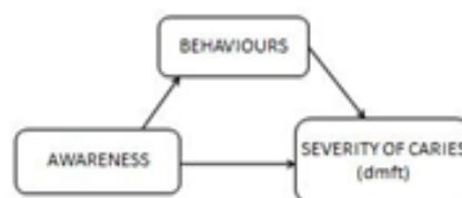
Figure 1. Theoretically proposed framework.

Basically, this research aims to study the relationship between awareness, behaviours and severity of caries represented by dmft value. In this proposed framework, behaviours (8 items) and awareness (12 items) have direct relationship towards severity of caries represented by dmft value.